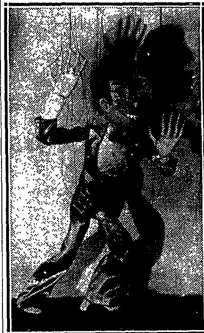
THE HARLEM DANCER

The Drama Department is this year inaugurating something new in bringing to the Little Theatre Stage some outside productions. The first of these is to be the Sue Hastings Marionette Company on October 19.