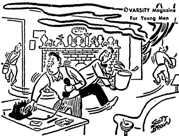
"TELL THEM IT'S A SORORITY HOUSE. THEY'LL MAKE BETTER TIME!"

TEMPLE: Mar. 10-11, "Riders of the Range" and "Black Shadow"; 12-14 "Holiday Affair"; 15-16 "Easy Living"; 17-18 "Saton's Cradle and Barbary Pirates"; 19-21 "On the Town"; 22-23 "They Live by Night"; 24-25 "Blondie Hit's the Jackpot" and "Riders in the Sky." ITHACA: Mar. 10-11 "Home of the Brave"; 12-14 "Inspector General"; 15-16 "Intruder Dust"; 17-18 "She Wore a Yellow Ribbon"; 18-21 "Fallen Idol"; 22-23 "Illegal Entry"; 24-25 "Oh You Beautiful Doll." STATE: Mar. 8-11 "Twelve O'Clock High"; 12-15 "Whirlpool"; 16-18 "Nancy Goes to Rio"; 19-21 "Man on the Eiffel Tower"; 22-25 "Francis." STRAND: Mar. 8-11 "Montana"; 12-15 "Red Shoes"; 16-18 "Woman in Hiding"; 19-22 "Dear Wife"; 23-25 "Dakota Lil."