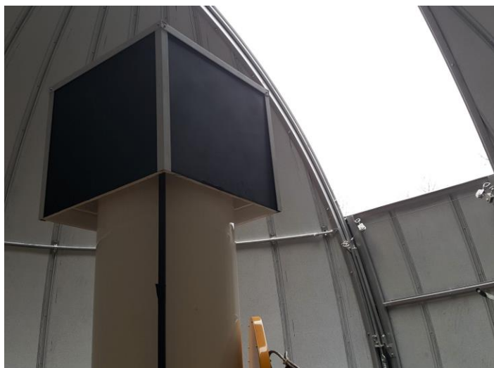
Figure 2: The large lightbox in black mounted on the telescope.

Results: By using this method of flat fielding, I improved the quality of our images, and hence the quality of our data. An example of the image improvement can be seen in Figure 3. Since the image is a graphical interpretation of the actual data taken, there is a direct relation between the quality of the image and the quality of the data.